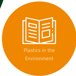
Plastics in the Environment