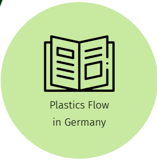
Plastics Flow in Germany

The special study on pellet losses is available in German or English free of charge via the BKV website: https://www.bkv-gmbh.de/studies.html