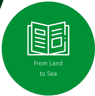
From Land to Sea